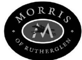
Morris Wines Mia Mia Vineyards (02) 6026 7303