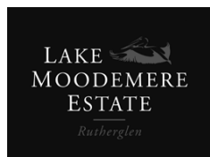
Lake Moodemere Vineyards Rutherglen (02) 6032 8118