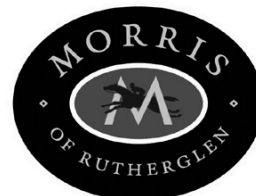
Morris Wines Mia Mia Vineyards (02) 6026 7303