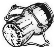
Andersons Winery Rutherglen (02) 6032 8111